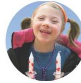
JEWISH DISABILITY INCLUSION & AWARENESS MONTH