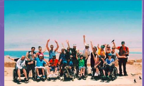
Inclusive Birthright Israel trip