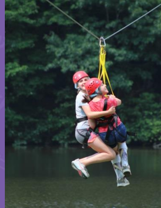
Fun for all at summer camp