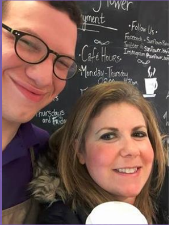
Café Sunflower & Bakery